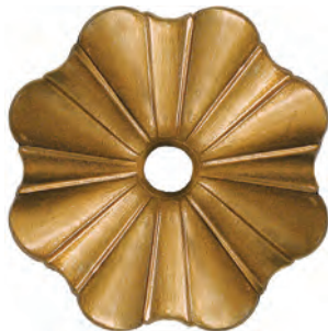
D-72 Dorado francés patinado partes lisas Satin french gold with oil patine