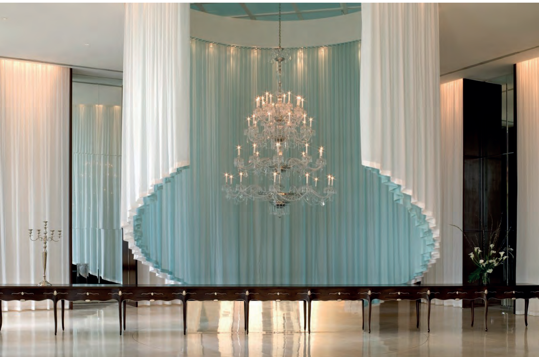
Martinez y Orts 55 arm crystal chandelier