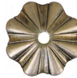
D-88 Plata antigua Antique silver