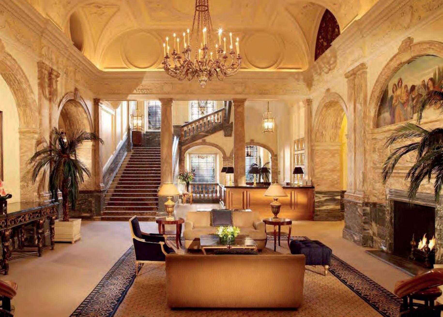
Casted lanterns and chandeliers at The Landmark

We are delighted to welcome you to one of the most popular 5 star hotels in London, The Landmark London. We rank among the finest of the capital's leading luxury hotels in London, and have a distinctive style and ambience that makes us unique.