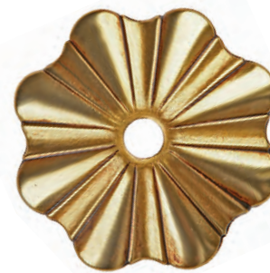
D-94 Dorado satinado pátina óleo With oil patine brass