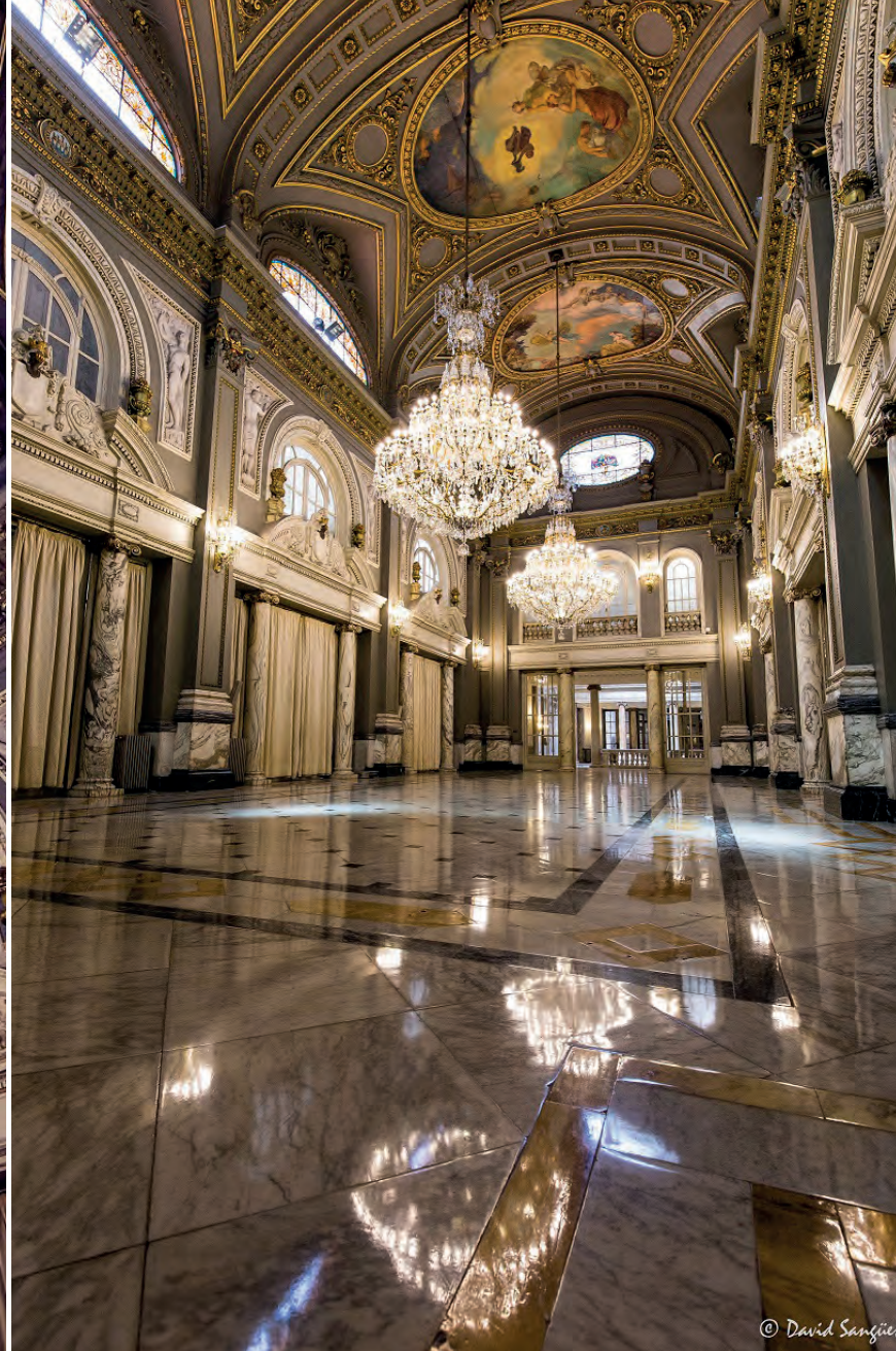
Martinez y Orts crystal chandeliers and wall lights in Valencia city hall

The Town Hall of the city of Valencia, seat of the Municipal Council, integrates, in an apple of slightly trapezoidal plant, two constructions of well-differentiated period and style: the House of Teaching, built on the initiative of the archbishop Don Andrés Mayoral, between 1758 and 1763, and the body of the building that constitutes the main facade, made between the second and third decades of the 20th century.