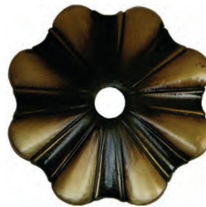
D-07 Cuero cepillado Mat shaded flemish