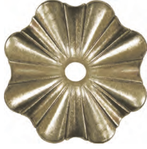
D-27 Níquel mate con pátina Satin chrome plated with patin