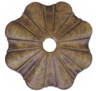
D-90 Pintura hoja seca Autum leave