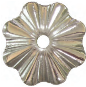
D-10 Plata pulida Polished silver plated