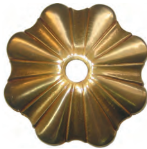
D-05 Dorado francés con pátina óleo French gold with oil patine