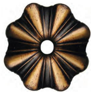
D-91 Cuero oscuro con toques High lighted dark flemish