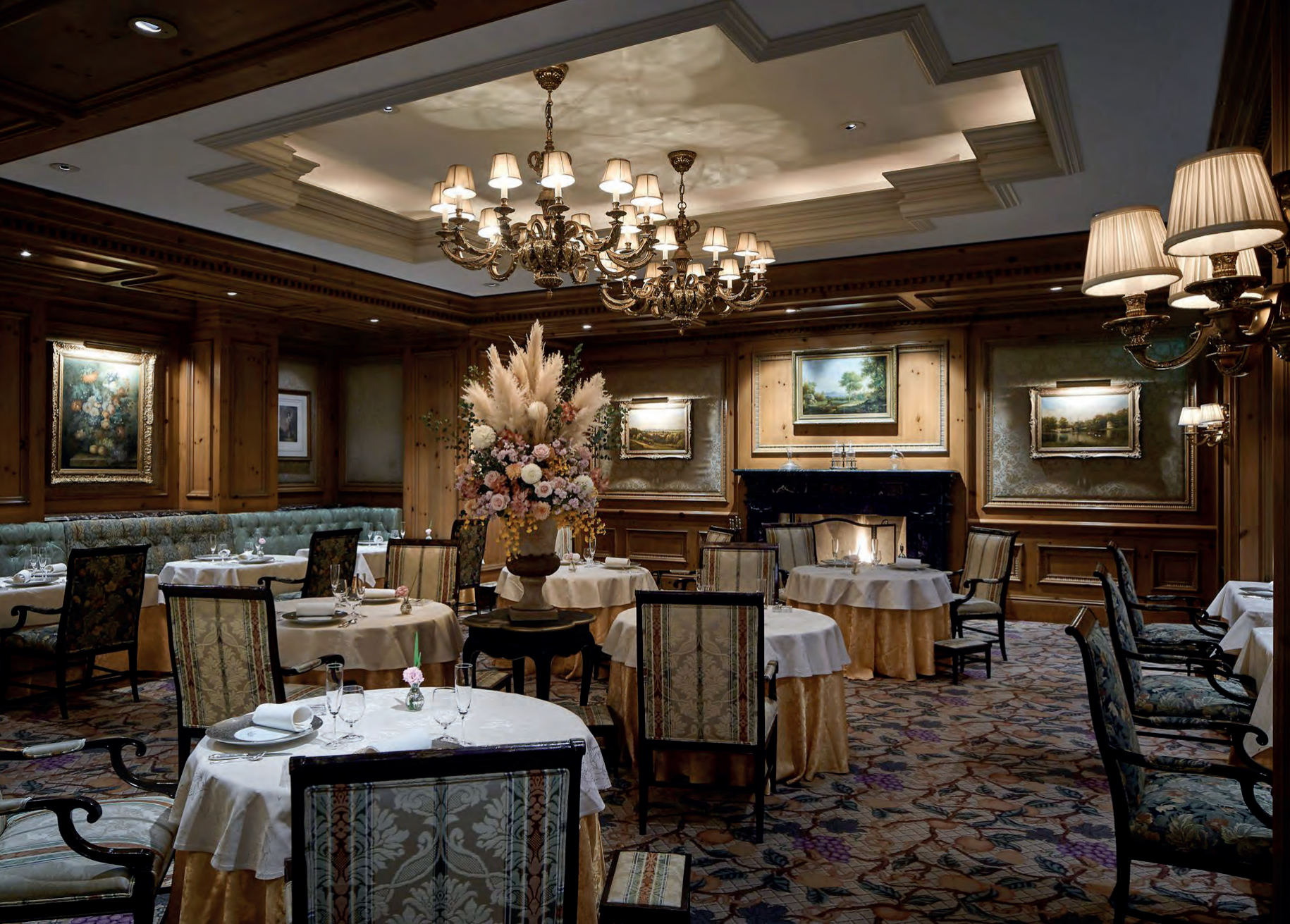
Casted chandeliers and wall lights

Martinez y Orts elegance dresses this stylish hotel in Japan and gives a touch of unique quality to the ambience.