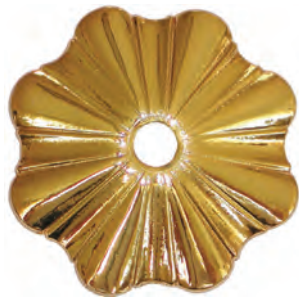
D-20 Oro fino 24 Karat gold plated