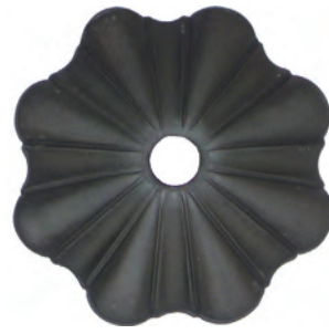
D-30 Cuero oscuro Dark flemish