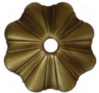
D-08 Cuero cepillado claro Uniform flemish