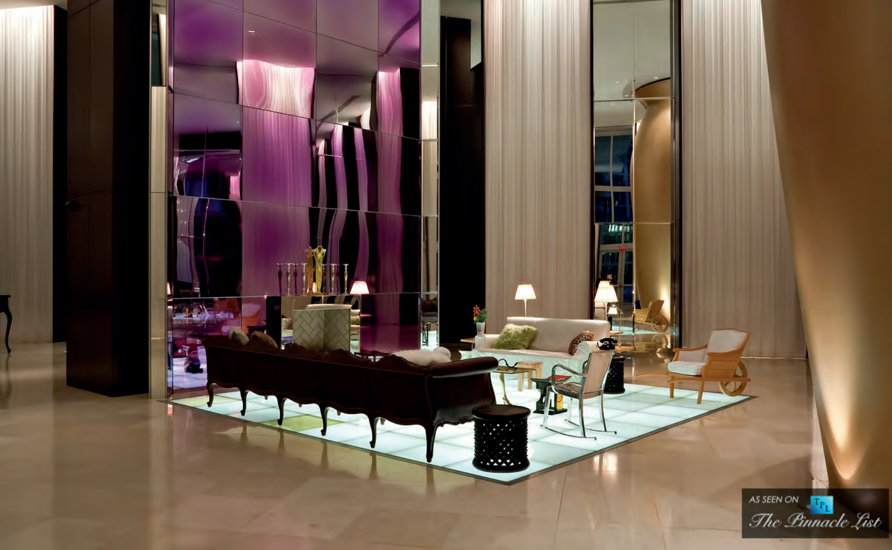
Lobby with Martinez y Orts lighting

ICON South Beach condos is located at the intersection of Alton Road and Fifth Street in the SoFi (South of Fifth) neighborhood of South Beach. Originally built in 2005, ICON offers a curvi-linear architectural style that not only maximizes the views of the Atlantic Ocean, Biscayne Bay and the Miami skyline but also captures the balmy breezes Miami is known for. ICON South Beach location gives easy access to Miami on the MacArthur Causeway or Miami Beach on the newly reconstructed Alton Road... (Whew...finally!)