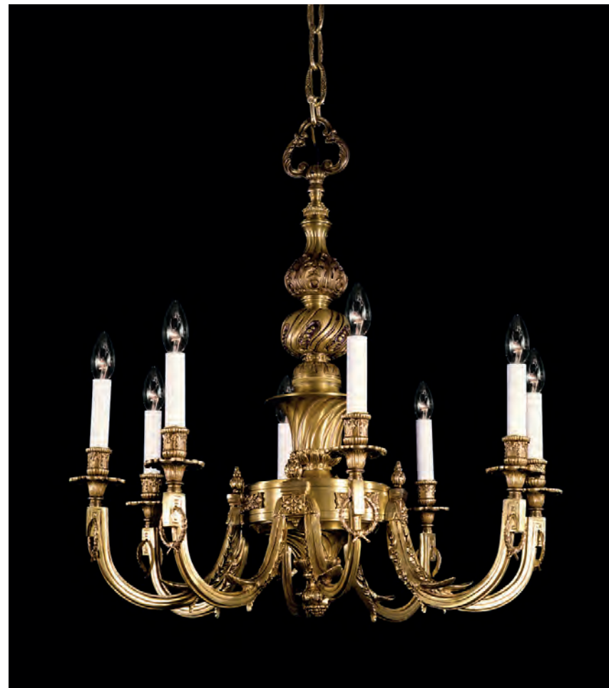
Chandeliers at lobby area

The Entrance of this hotel shows two elegant lanterns of Martinez y Orts collection. These lantern give a unique look of high class to the entrance of this elegant hotel. The Lobby area is decorated with 6 chandeliers hand made in sand cast brass appearing at the image on the right.