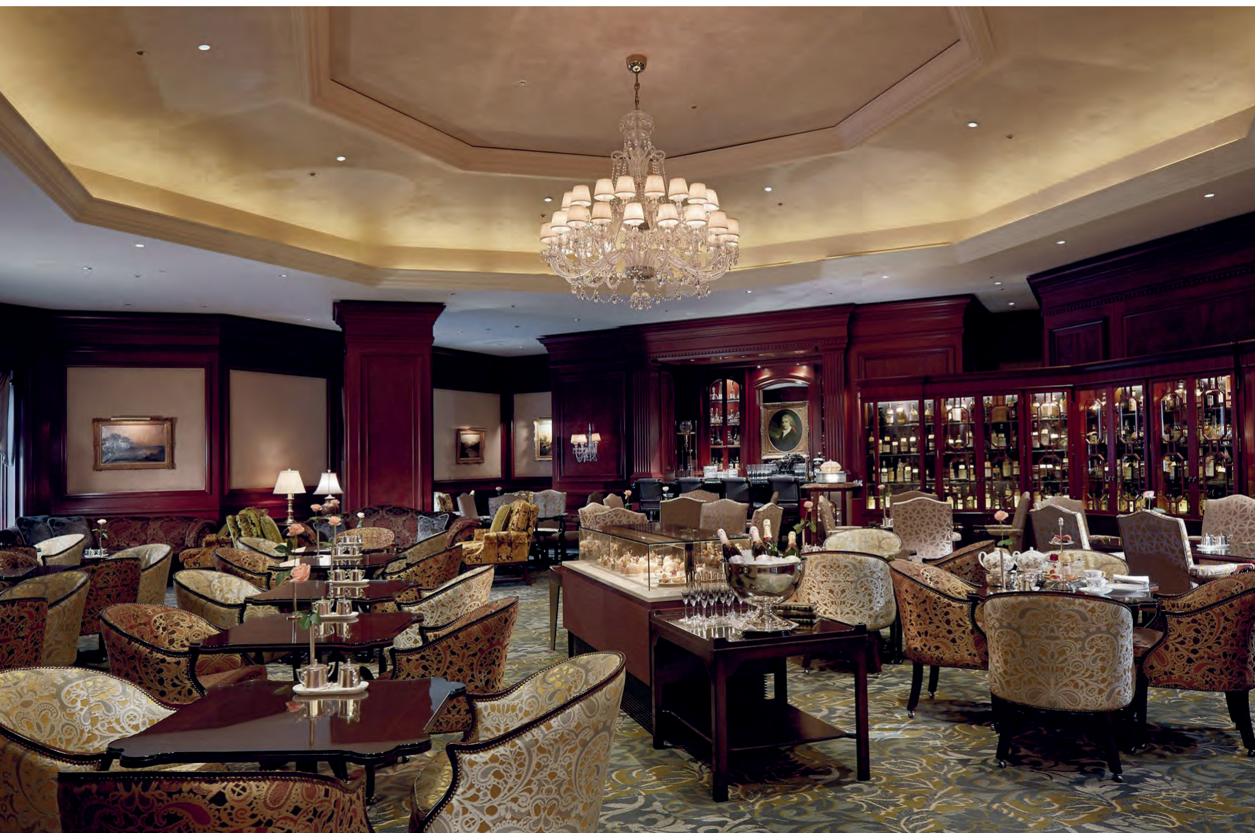
Bohemian Crystal arm chandeliers