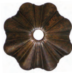
D-93 Bronce a manchas Distressed antique bronze