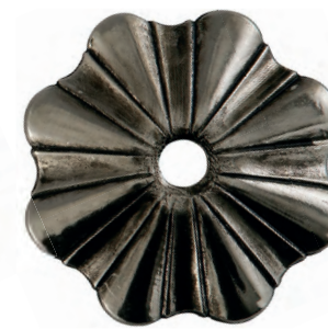
D-98 Níquel+óleo negro Nickel+oil patine

DECORADOS: Por su realización totalmente artesanal son orientativos pudiendo variar en relación a lo aquí presentado. FINISHES: Because its manufacture is totally artisan, they are orientative and they can change in relation to represented here.