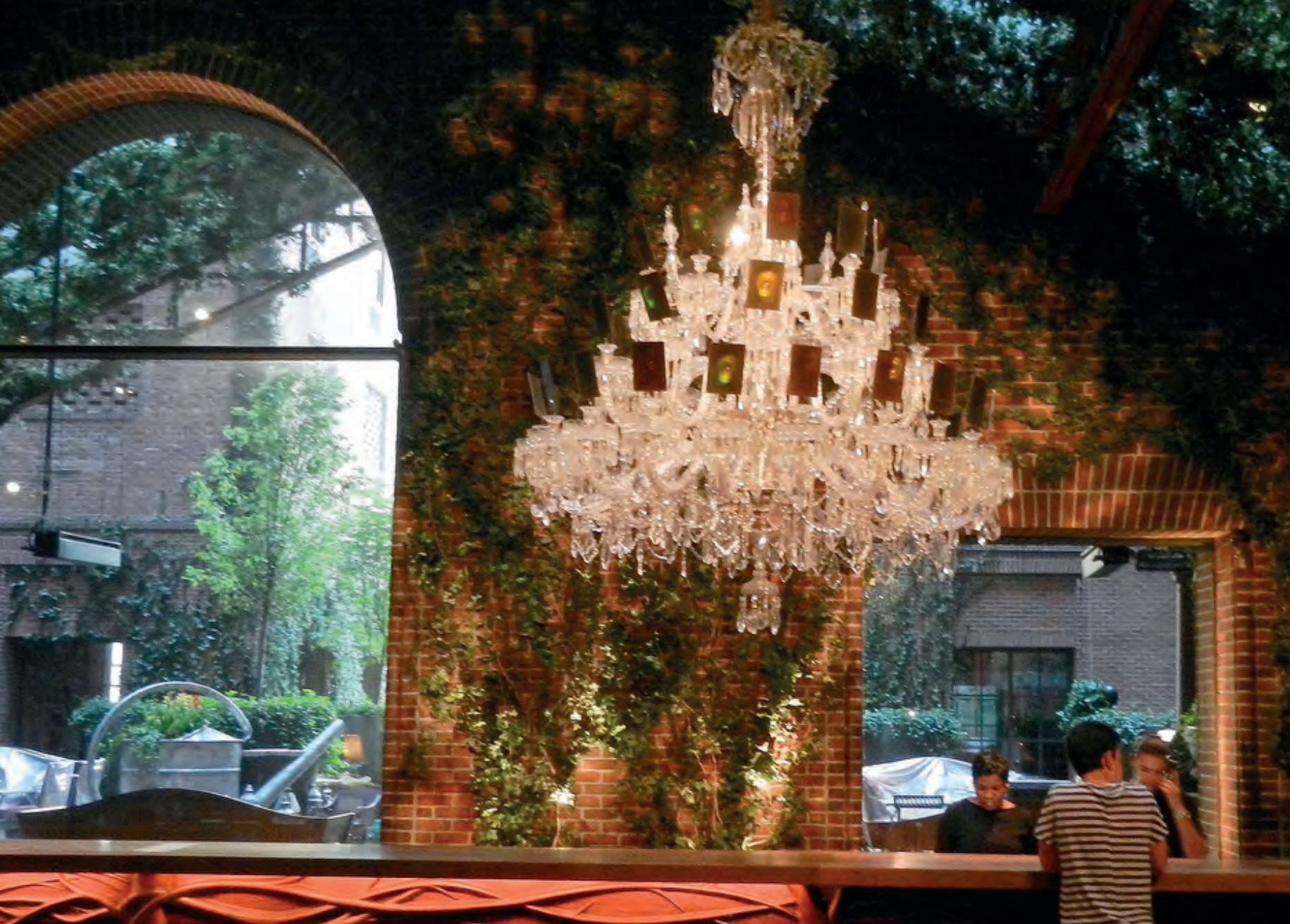
Martinez y Orts 44 light Crystal Chandelier

An energetic social hub filled with urban adventure and daredevil design, Hudson takes convention and turns it on its head. Born from the innovative vision of design impresario Philippe Starck, Hudson, a New York boutique hotel, is stylish, democratic, young at heart and utterly cool.