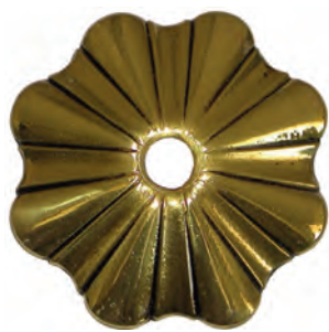
D-04 Dorado francés con pátina marrón French gold with brown patine