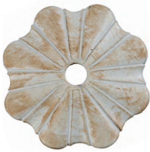
D-26 Blanco decapé Decapé white