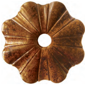
D-21 Dorado francés antiguo Antique french gold