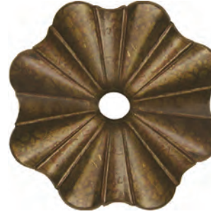
D-77 Bronce oxidado antiguo Rust antique bronze