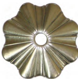
D-53 Níquel mate Satin chrome plated