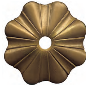
D-24 Piezas matizadas. Barniz oscuro Dark lacquer on mat finish