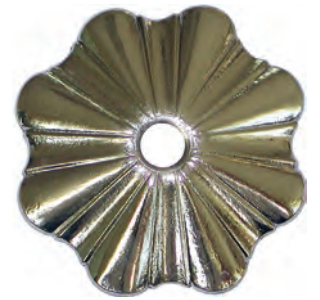
D-25 Níquel Polished chrome plated