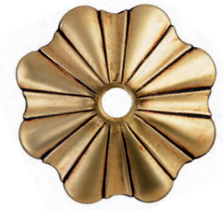
D-43 Oro victoriano 24k Victorian 24k gold plated