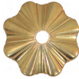
D-42 Oro fino mate 24 Karat satin gold plated