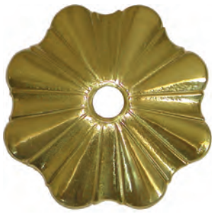
D-02 Dorado pulido (barniz incoloro) Polished brass