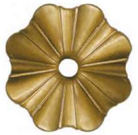
D-72 Dorado francés patinado partes lisas Satin french gold with oil patine