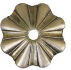
D-88 Plata antigua Antique silver