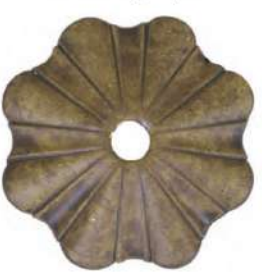
D-90 Pintura hoja seca Autum leave