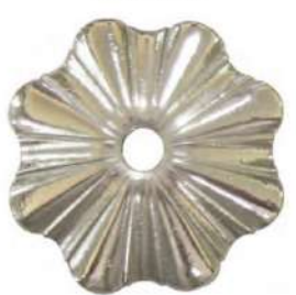
D-10 Plata pulida Polished silver plated