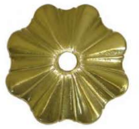
D-02 Dorado pulido (barniz incoloro) Polished brass