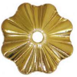
D-20 Oro fino 24 Karat gold plated