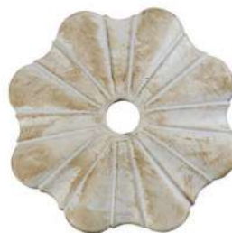
D-26 Blanco decapé Decapė white