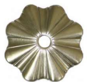
D-53 Níquel mate Satin chrome plated