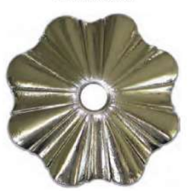
D-25 Niquel Polished chrome plated