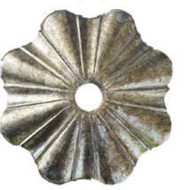
D-27 Níquel mate con pátina Satin chrome plated with patin