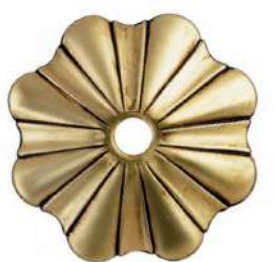
D-43 Oro victoriano 24k Victorian 24k gold plated